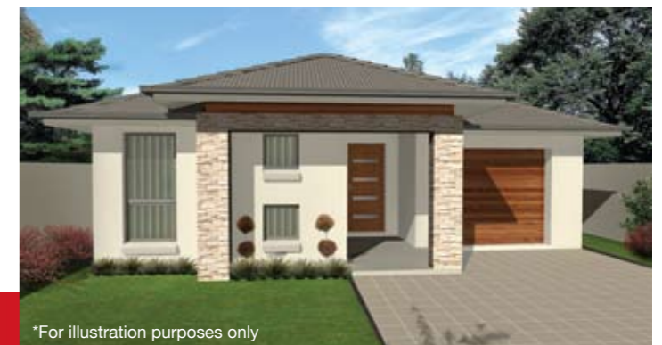
*For illustration purposes only